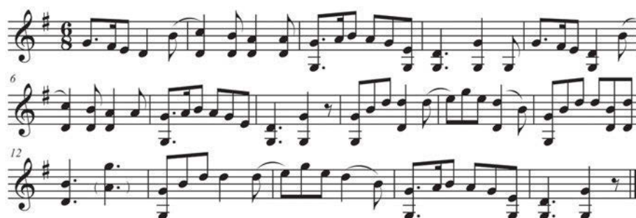
Figure 7 Simplified transcription of the playing of Sam Bennett Carpenter Collection, Cylinder 105 06:39

how Sam Bennett played it, and how I play it. Research into how the brain processes and remembers music has shown that the greater number of neural links involved, the stronger and more powerful the memory. 27 In addition, Levitin, writing about music, states ‘people use the same brain regions for remembering as they do for perceiving’. 28 In the case of ‘Bumpus o Stretton’, this particular transcriber had memorized, rehearsed and performed on many occasions both the tune and the dance. This repeated use of multiple neural links, reinforced over time, created overpowering musical memories that threatened to override the perception of the weak and sometimes broken sound coming through the headphones. There is much to be said about being too close to the subject. It is far better to keep the transcription simple and general rather than complex and specific. Too much detail may actually impede understanding, and in-depth scrutiny shifts the focus from the tune to the performance. Also, keeping it simple helps guard against the possibility of memory overriding perception (see Figure 7).