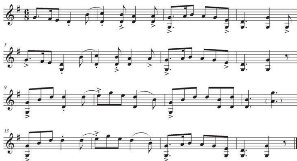
Figure 6 An overly detailed transcription of the playing of Sam Bennett Carpenter Collection, Cylinder 105 06:39

The transcriber must keep in mind the use for which the notation is intended. My first fiddle tune transcriptions were heavily marked with accents and articulation to indicate nuances of pressure and motion of the bow arm (see Figure 6). I was listening and transcribing as a fiddle player, intent on the minutia of the captured performance, and notating information that would be needed to reproduce this performance. When presented with the detailed notation, my colleagues (who are not fiddle players) did not hear the accents and articulations that were noted, or understand what they represented in terms of violin playing technique. To them, and to most people who do not have experience with the notation peculiar to bowed strings, this was superfluous and possibly confusing information. After some discussion, it became a team policy to note down only pitch and rhythm, omitting stylistic indications such as articulation and accent, in part to make the transcriptions more useful to a wider audience.