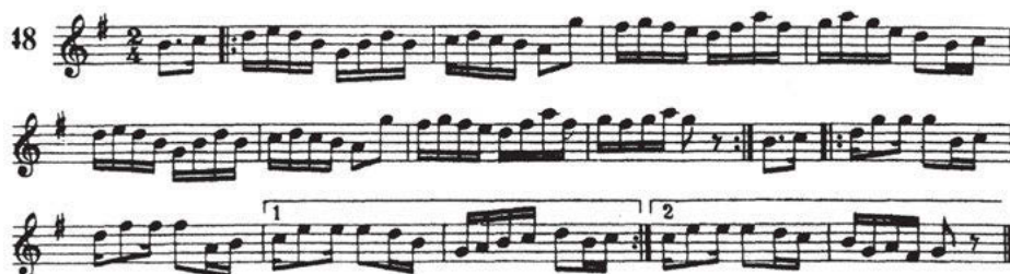
Figure 1 'The Old Man and the Old Woman'

repeated for a competitive Ottawa Valley step dancing routine. Although the clog is only played once through, A A B B, the jig is played once and a half, A A B B A A. The reel is played three times, usually changing tunes for the last 32 bars. So we have A A B B A A B B for one reel and then A A B B for the second. Notice, for example, that the A part is played four times in the jig and the first reel. The dancer then will have to come up with four visually different ways to create that particular rhythm. Of course, for many of these tunes, there is melodic repetition within each larger section. So, if the dancer is dancing to, say, 'The Old Man and the Old Woman' as the first reel, he or she would have to find eight visually different ways to create the same syncopated rhythm of the B section (see Figure 1).