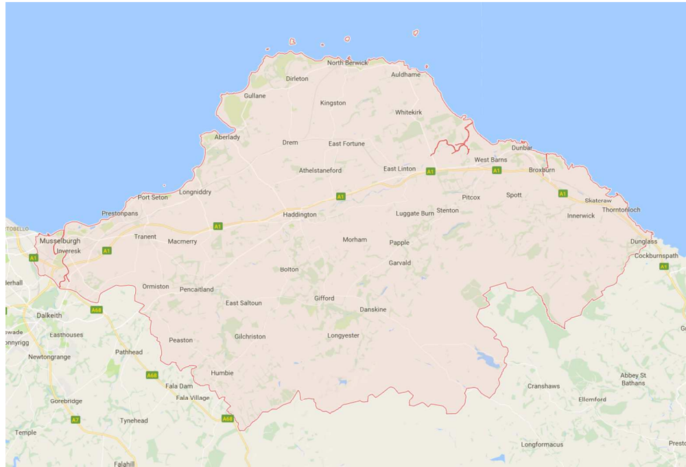
Figure 2: Map of East Lothian showing settlements and the principal transport network