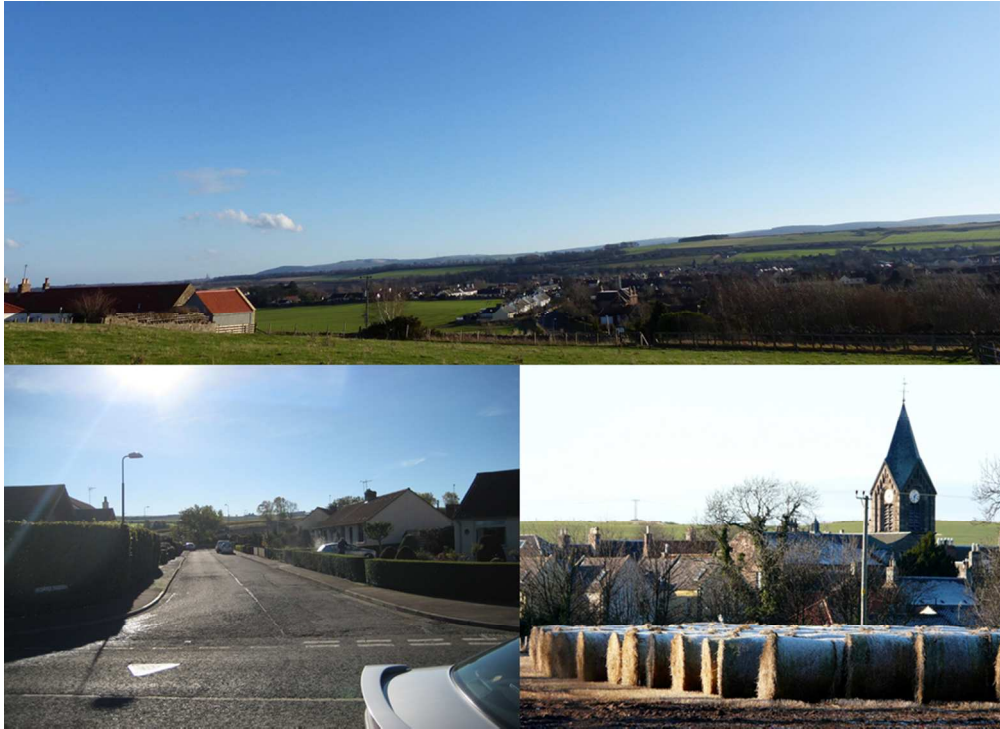
Figure 3: Montage of North Kirkton (Top Photo 'The View' and Left Photo 'The Hills from the Living Room'; Right Photo 'The Hay, The Village, The Hills')