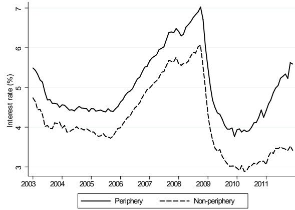
Figure 1: This figure presents the average interest rate on new loans below 1 million euro to non-financial corporations over the period 2003-2011 across a sample of euro area countries, separating periphery (Ireland, Italy, Portugal and Spain) from non-periphery economies (Austria , Belgium, Finland, France, Germany, Luxembourg and Netherlands).