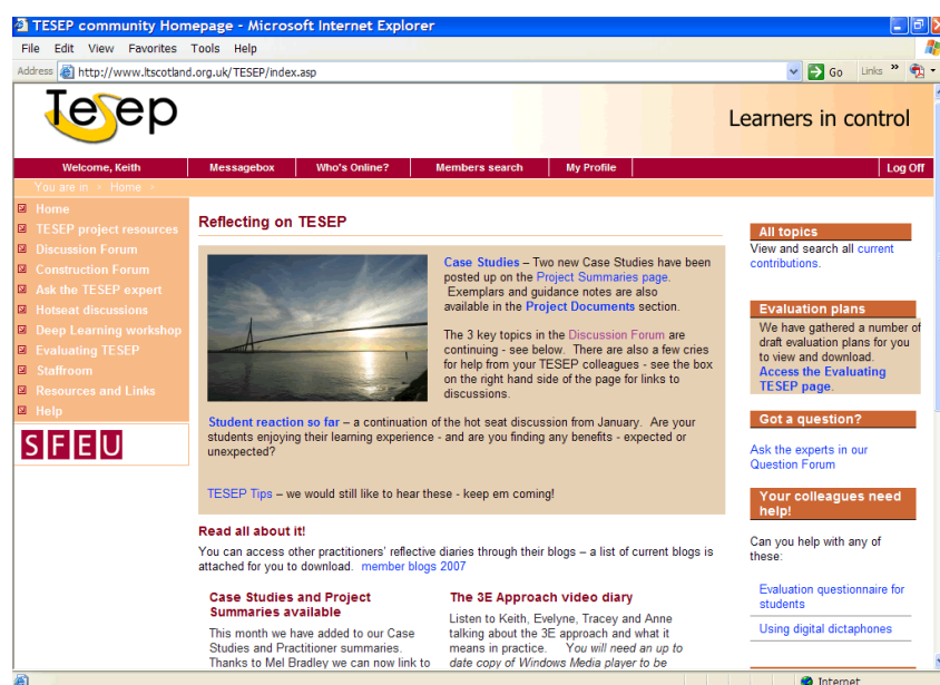
Figure 1. Online community resource for TESEP practitioners

Mirroring a staff support model that came to be adapted within the partner institutions post-project, each practitioner was also assigned a mentor from within the TESEP 'expert group' who acted as their personal point of contact and provided individualised support throughout the course redesign, implementation and evaluation process.