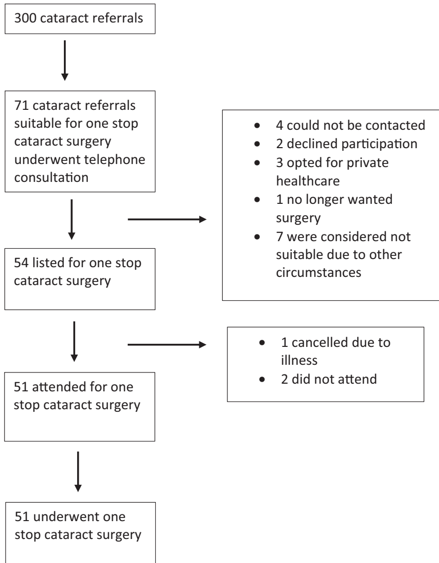
Fig. 2 Selection process for suitable patients to undergo one stop cataract surgery.