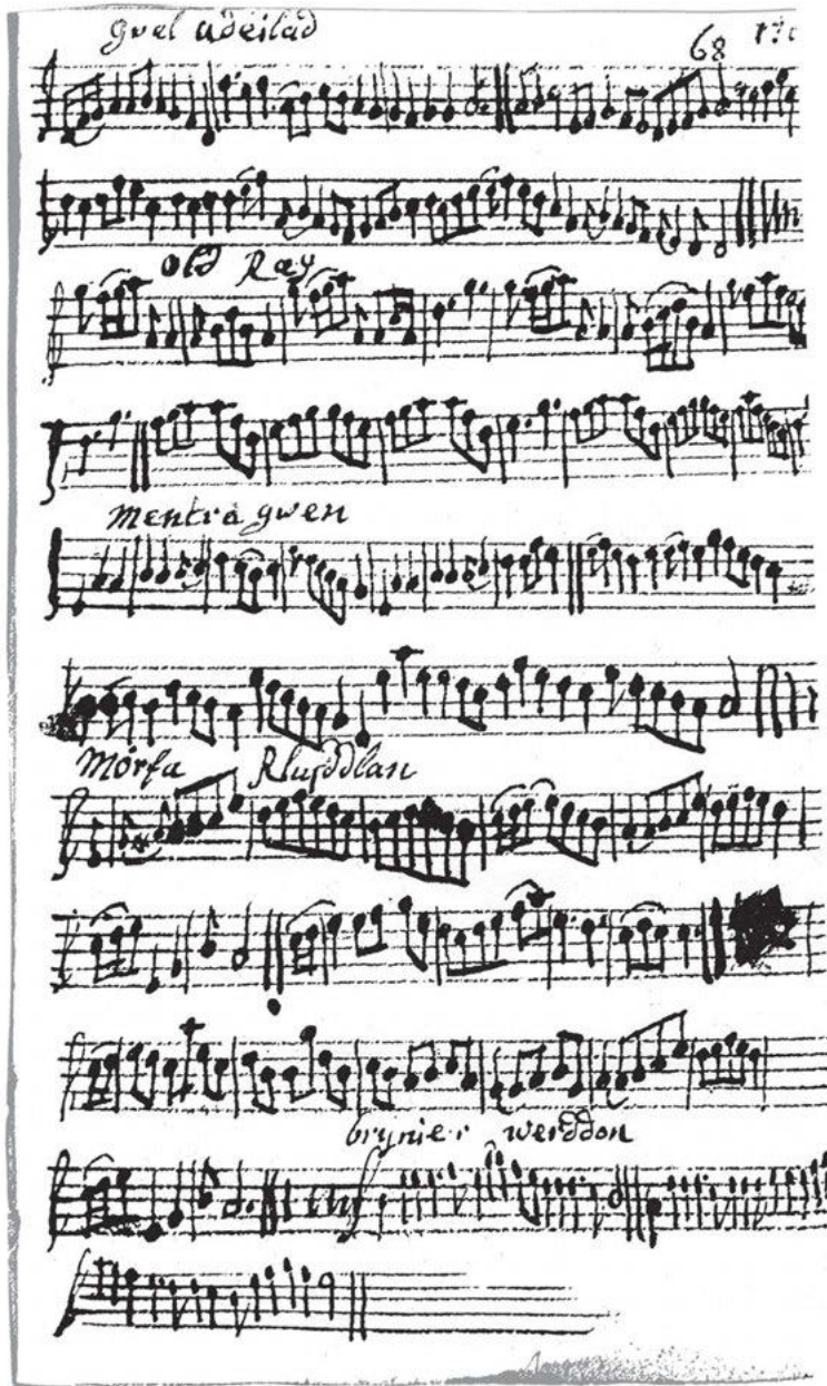
Figure 1 A page from the John Thomas MS, fol. 68r.

old cerdd dant repertoire; among these is 'Drugan Troed Tant', or 'Erdigan Tro'r Tant' as it is found in other contemporary collections ('The erddigan of the turn of the string'), whose title harks back to the old 'tro tant' harp tuning. The majority of the melodies are country dance tunes and minuets from across the border, a considerable number