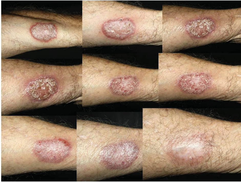
Figure 2. Treatment of chromoblastomycosis from time 0 to 20 months' application of topical imiquimod 5% plus itraconazole 200 mg day -1 [9]. With thanks to Paulo R. Criado and Walter B. Júnior and G. de Sousa.

without concurrent oral antifungals, was highly active in promoting the elimination of F. pedrosoi from skin lesions [9]. It is therefore important to understand the virulence properties and immune recognition of the major fungal pathogens in order to inform augmentative immunotherapy options. At present, our understanding of these areas is dominated by investigations of model pathogens such as Candida albicans , and we are not yet able extrapolate this knowledge to be predict how even related Candida species induce pathology.